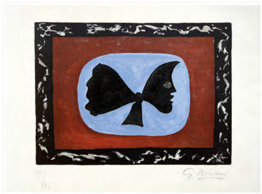
Georges Braque - Uranie II, 1958, Galerie Arenthon

Featured image: Hendrick Goltzius - Le Dragon devant les compagnons de Cadmos, 1588. Sarah Sauvin Gallery. All images courtesy of Paris Print Fair.