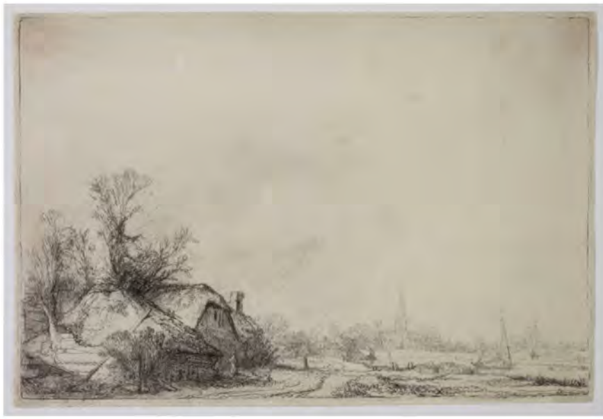
Rembrandt Harmenszoon van Rijn - Chaumière près d'un canal avec vue sur la ville d'Ouderkerk, c. 1641. Sarah Sauvin