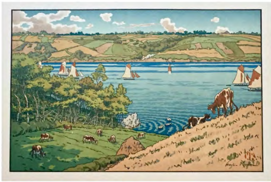
Henri Riviere - Le-Trieux-a-Kermarie, Galerie Christian Collin