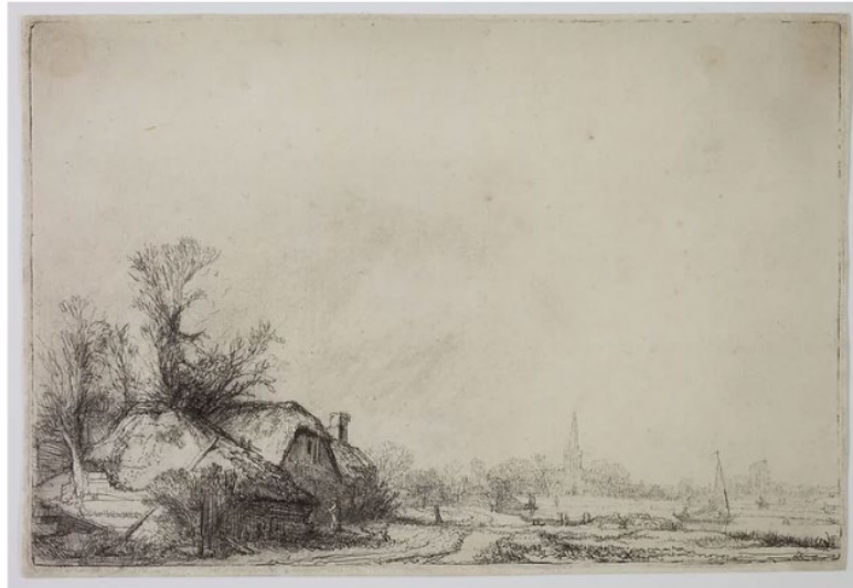
Rembrandt Harmenszoon van Rijn-Chaumiere, pres d'un canal avec vue sur la ville d'Ouderkerk 1641. By REMBRANDT HARMENSZOOM VAN RIJN (1606 - 1669)