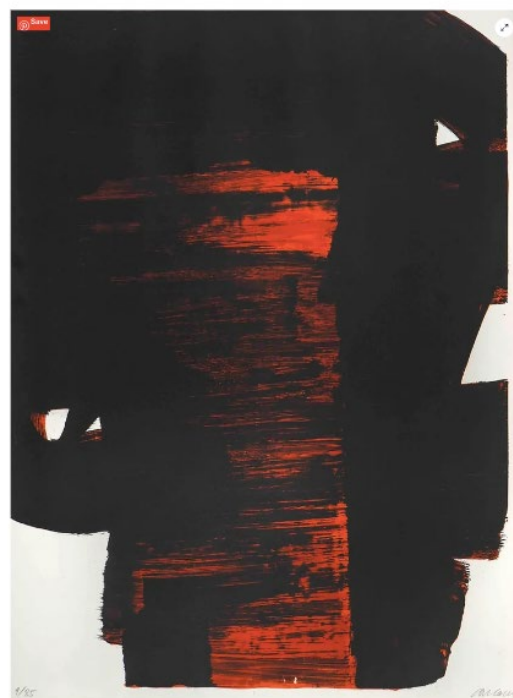
Pierre Soulages, Lithographie N26-1969. Le Coin des Arts | Original prints, lithograph, Paris