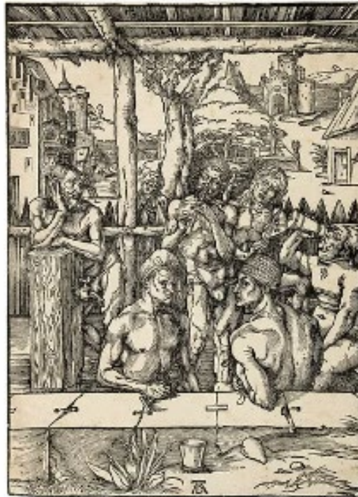
Albert Dürer, The Men's Bath-circa1496/97.