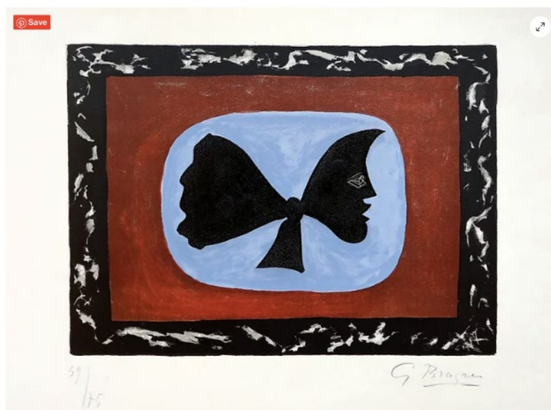
Galerie Arenthon - Parisgaleriearenthon.com In association with the Galerie de l'Institut, formerly the Bouquinerie de l'Institut, Arenthon specializes in prints, posters and modern illustrated books. It offers original works by great 20th-century artists.

The Paris Print Fair, which is held concurrently with the Paris Drawing Week, provides a small-scale fair setting where both newcomers and art enthusiasts can take the time to converse and enjoy the artwork on display. The exhibitors of this very specialised event will present works from different art schools and art movements, from the first great masters of printmaking - Dürer, Rembrandt, etc. - to modern artists such as Goya or Picasso, and contemporary artists.