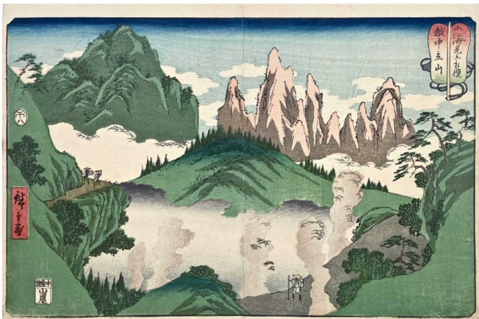
Ando Hiroshige (1797 – 1858), Le Mont Tateyama dans la Province de Etchû, 1858, presented by Collin Estampes

The Paris Print Fair, the first event dedicated to printmaking in its uniqueness, follows the Estampe and Drawing Salon, held for the last time in 2016. The CSEDT had already injected new dynamics by creating the Parisian Printmaking and Drawing Galleries Week in 2018, now making the Paris Print Fair the annual gathering dedicated entirely to this practice for both specialists and the general public.