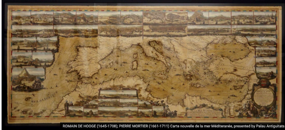
ROMAIN DE HOOGE (1645-1708), PIERRE MORTIER (1661-1711) Carte nouvelle de la mer Méditerranée, presented by Palau Antiquitats

Following the success of last year's edition, Paris Print Fair will return from March 21st to March 24th, 2024, taking place in the refectory of the Cordeliers Convent, located in the heart of the 6th arrondissement . This new edition will host twenty exhibitors, associate members of the Chamber Syndicate of Printmaking, Drawing, and Painting (CSEDT), who have curated their finest prints.